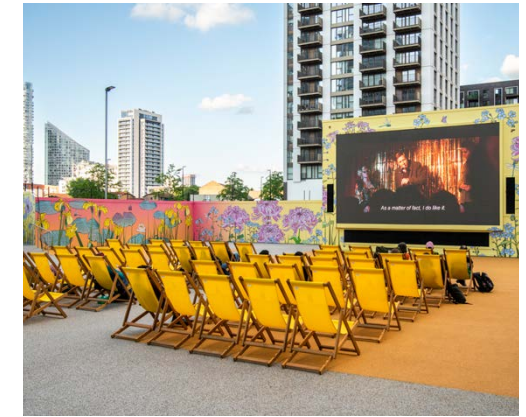
Summer Screens at Union Square