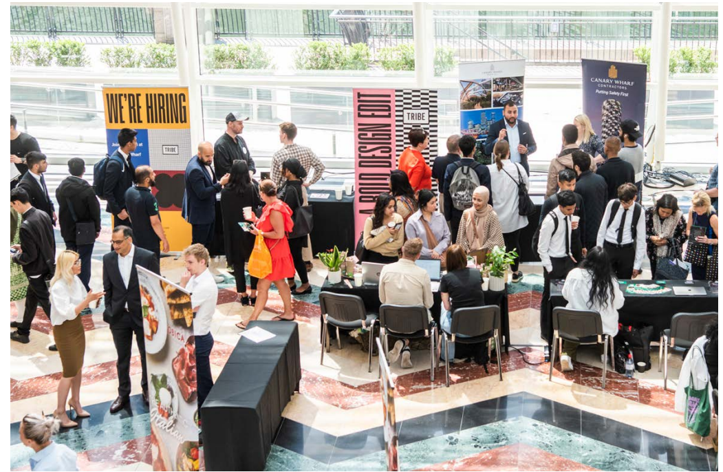
Job Fair event in June held at East Wintergarden

This partnership builds upon LaSS's established 15-year track record for delivering social value initiatives through integrated partnership delivery models to overcome the acute skills shortage identified in the construction industry. For more information, please contact Learning and Skills Solutions on 0207 418 2527.