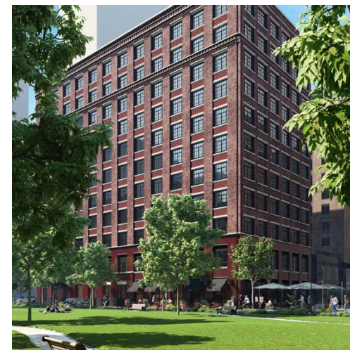
CGI 8 Harbord Square

The newest private for sale building, 8 Harbord Square (or G7) is a departure from the first two buildings at Wood Wharf, One Park Drive and 10 Park Drive, in that it is a reimagining of the original warehouses that would have been found around Canary Wharf some 150 years ago. Its scale, just 12 storeys with 82 apartments in total, means it will appeal to those looking for a more boutique offering than the towers on offer up until now. The layouts of the apartments are also radically different, with the internal walls between rooms removed, creating an open plan space (except for the bathroom!). The construction is on-going, with the concrete structure completed in February this year, and the cladding installation up to level 10. The entire building is wrapped in a plastic protective sheet to avoid the risk of falling objects from height. The internal fit-out works have commenced in June.