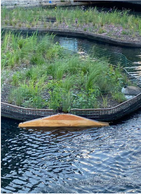
A ramp has been installed for wildlife to access and egress