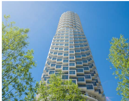
Award winning residential building – One Park Drive

Owning a circular, geometric form, One Park Drive is arguably one of the most distinctive residential buildings on the capital's skyline, created by the stacking, rotation, and mirroring of individual floor plates. The building offers state-of-the-art amenities, including 24-hour concierge, full equipped gymnasium, and 20-metre swimming pool.