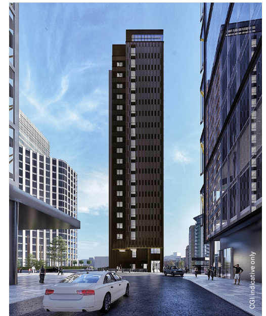
B2 CGI south elevation