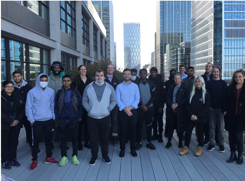
Students, tutors, and visitors to D1/D2 balcony as part of Open Doors event