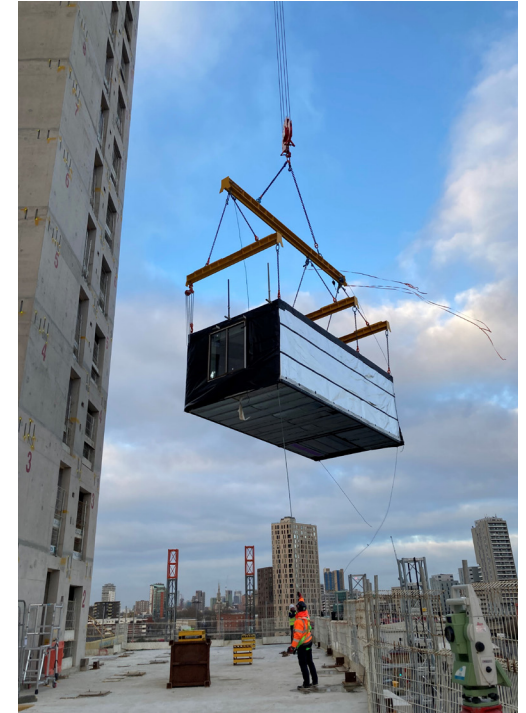
Tower crane delivering modules at B2

This is also a milestone for Canary Wharf Group as this is our first venture into using major off site pre-fabrication techniques, reducing the need for on-site resources and providing a more carbon neutral and environmentally friendly method.