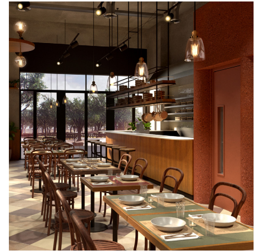
Emilia's Crafted Pasta interiors

The second pavilion (K2), will welcome The London Project . The landscaping works are now complete on the water level as well as by the dock edge. A floating island has been installed, 5 new trees have been planted, and a 13mx1m planter has been placed into position ready to bloom in the spring.