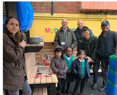
Newly constructed mud kitchen for Virginia Primary School