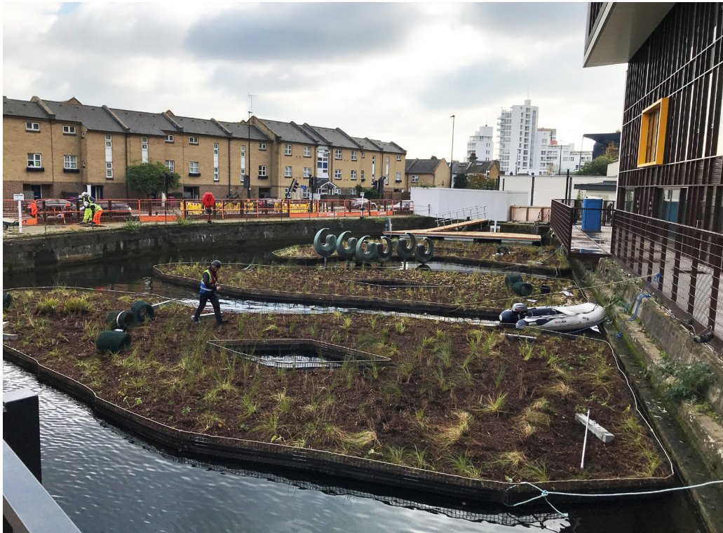
Floating ecosystem habitat