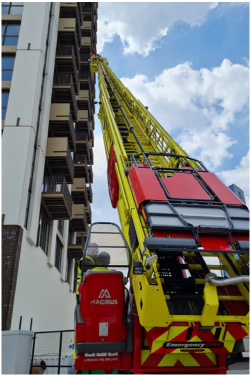
London Fire Brigade

Earlier in May, the Wood Wharf project team held a celebration for achieving one million hours without a RIDDOR (Reporting of Injuries, Diseases and Dangerous Occurrences). Canary Wharf Contractors provided a free meal to all site personnel as part of the celebrations.