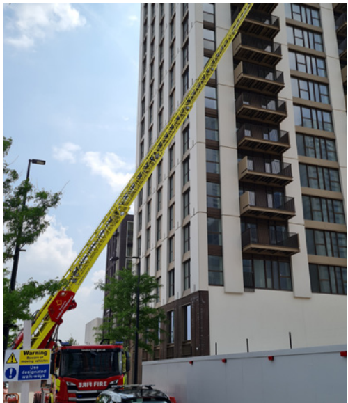
London Fire Brigade

In June, we were delighted to lend our construction site at Wood Wharf to the London Fire Brigade (LFB). LFB used our site to undertake team training to test out some of their new firefighting equipment.