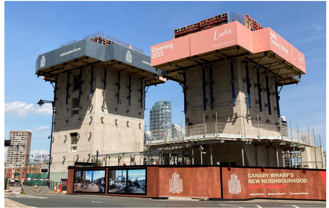
B2 north and south core structures

A continued commitment to retaining exceptional and excellent scores shows the company's overarching commitment to sustainability and best practice collaborating with graduates to research areas of improved health and well-being, to join with industry partners in the development of ultra-