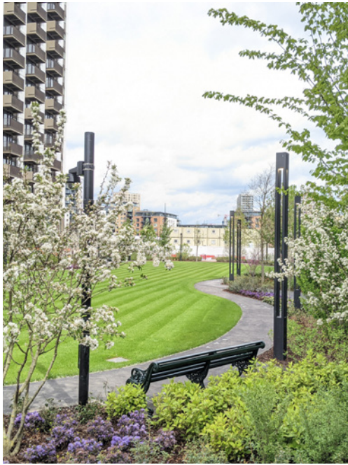
Harbord Square Park