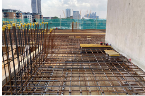
B2 steel reinforcement

of steel rebar encased in 750m 3 of concrete. 100 concrete wagons will feed a constant supply through a mobile concrete pump. Due to the size of the slab, this pour will be divided into two sections.